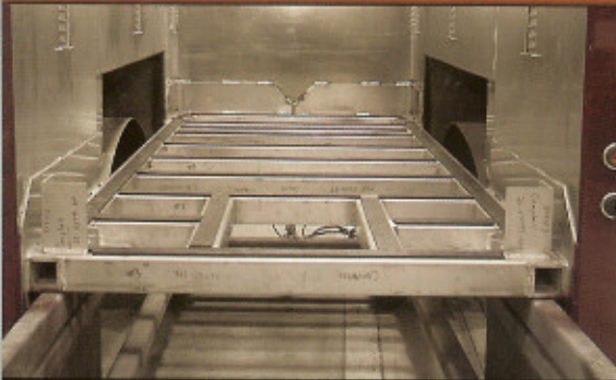
Self-supporting integral sub-frame for maximum strength